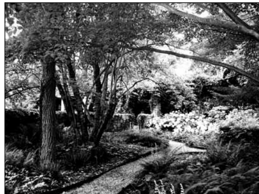
Native Garden — in need of plant signage

T he Watnong Chapter of the North American Rock Garden Society has also given us another generous grant which will enable us to provide more plant signage in the walled garden and the native garden. Last year we were able to add 22 metal accession tags on woody plants and 159 new labels on perennials. This year we will be able to continue our plant signage program, which will help answer the “what is that?” question we are always being asked.